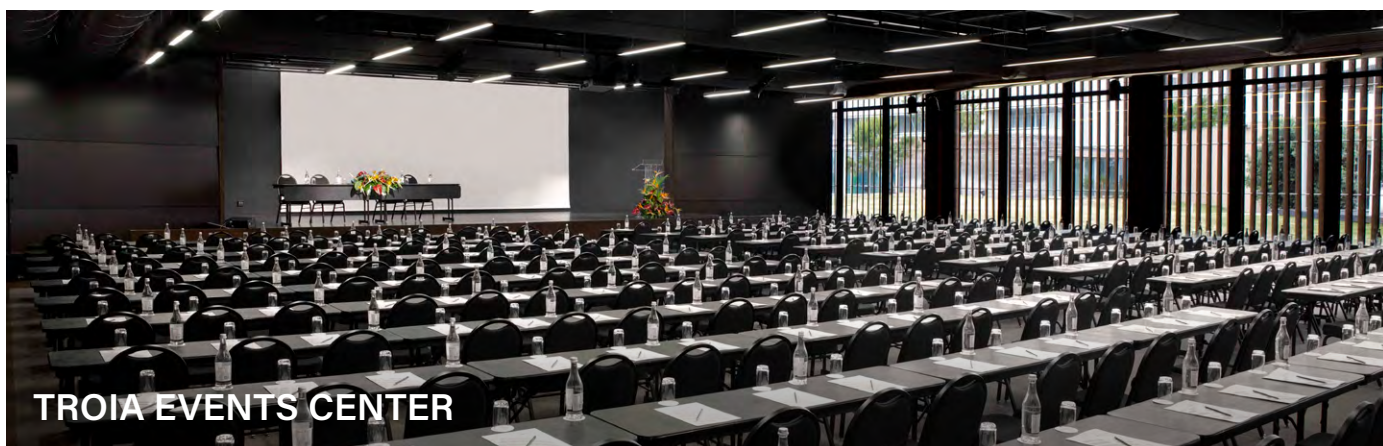
TROIA EVENTS CENTER

For meetings, new product launches, congresses, incentives, conferences or even a private party, get to know the Troia Events Center and make success a common place. Natural light, Wi-fi Internet, Audiovisual facilities, Room amenities, Coffee breaks, Catering.